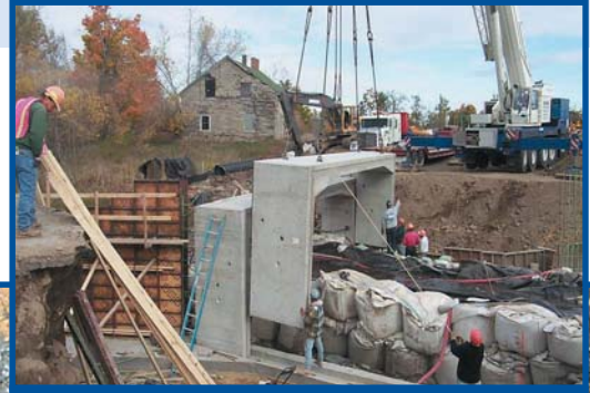
HY-SPAN, the Instant Bridge™, is the precast reinforced method of fast, easy bridge replacement, keeping the project on-time and on-budget.