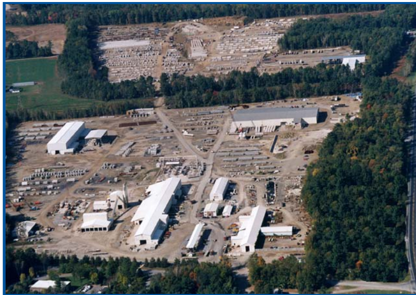
FORT MILLER SPECIALIZES IN “INVISIBLE CONSTRUCTION™.”