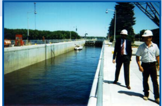
LOCK CHAMBER WALLS: High performance precast concrete panels are used to re-face existing deteriorated chamber walls.